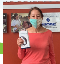
Wellness Referral Center Patient Testimonial

For more information, please call: 505-455-5332