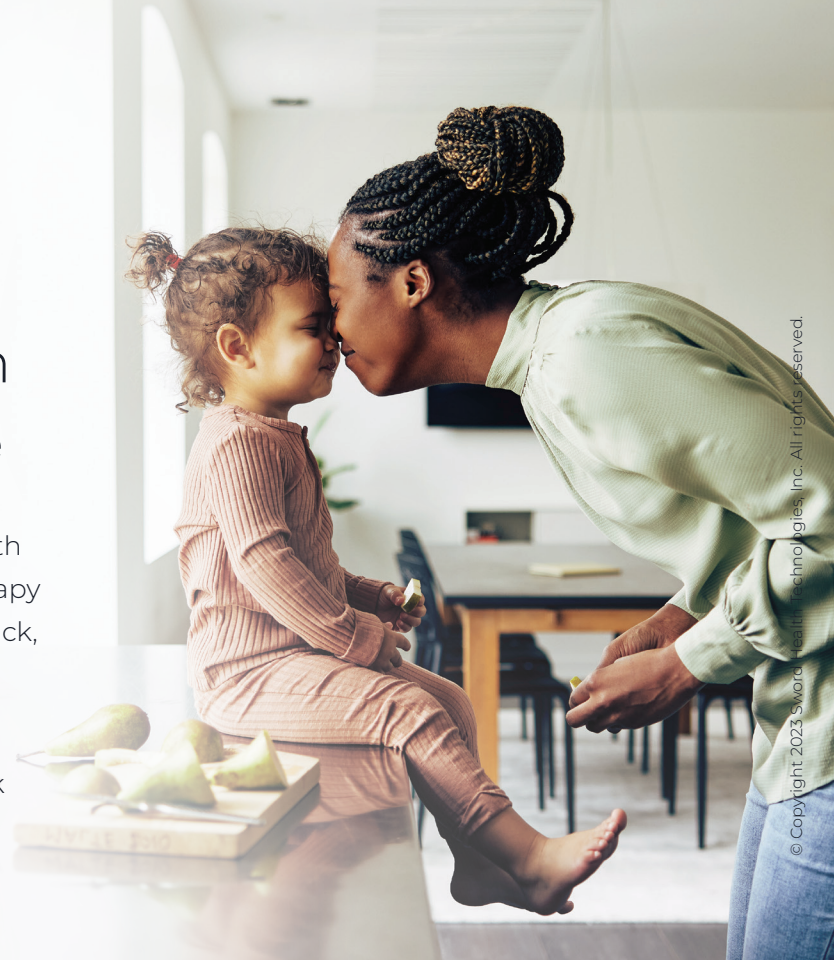
© Copyright 2023 Sword Health Technologies, Inc. All rights reserved.

Combining licensed PT with easy-to-use technology, Sword is more than just convenient. It's proven to work better than in-person physical therapy, too. 1