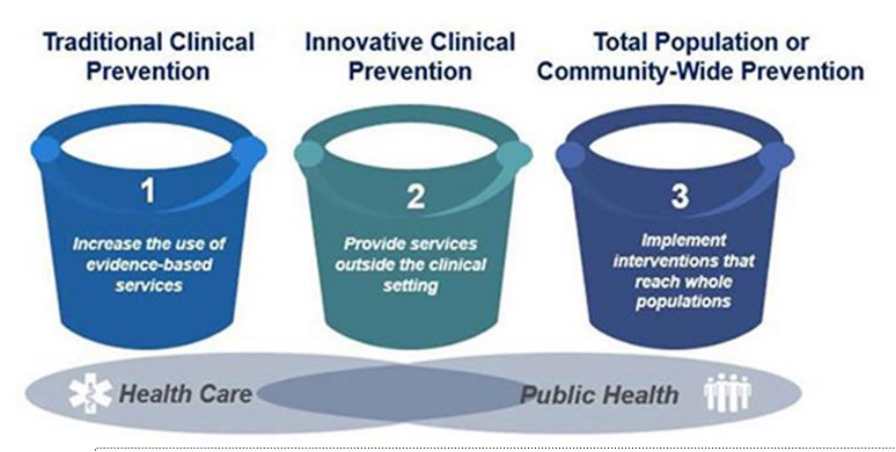
Figure 1 Use of the CDC Three Buckets of Prevention Framework

Evidence supporting strategies and interventions was drawn from The County Health Rankings – What Works for Health<sup>5</sup>, The Substance Abuse and Mental Health Services Administration (SAMHSA) and its National Registry of Evidence-based Programs and Practices (NREPP), CDC recommended community strategies, and the US Preventive Services Task Force.