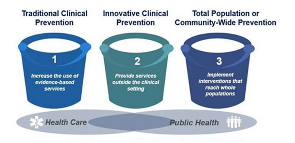
Figure 1 Use of the CDC Three Buckets of Prevention Framework

Evidence supporting strategies and interventions was drawn from The County Health Rankings – What Works for Health<sup>5</sup>, The Substance Abuse and Mental Health Services Administration (SAMHSA) and its National Registry of Evidence-based Programs and Practices (NREPP), CDC recommended community strategies, and the US Preventive Services Task Force.