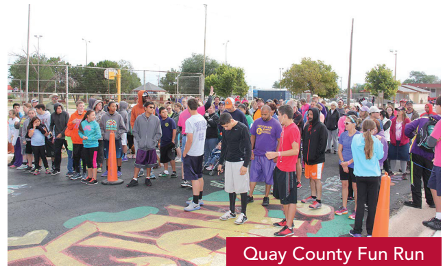
Quay County Fun Run

Prescription pads and rack cards have also been distributed to all local medical providers. This provides the opportunity to discuss the importance of active living for health in a clinical setting.