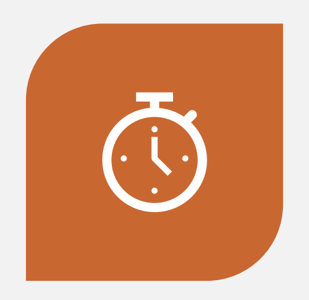
THE MCOS ARE SEEING MANY PACKETS SUBMITTED WITH OUTDATED FACILITY NAMES, NPI AND/OR TAX ID